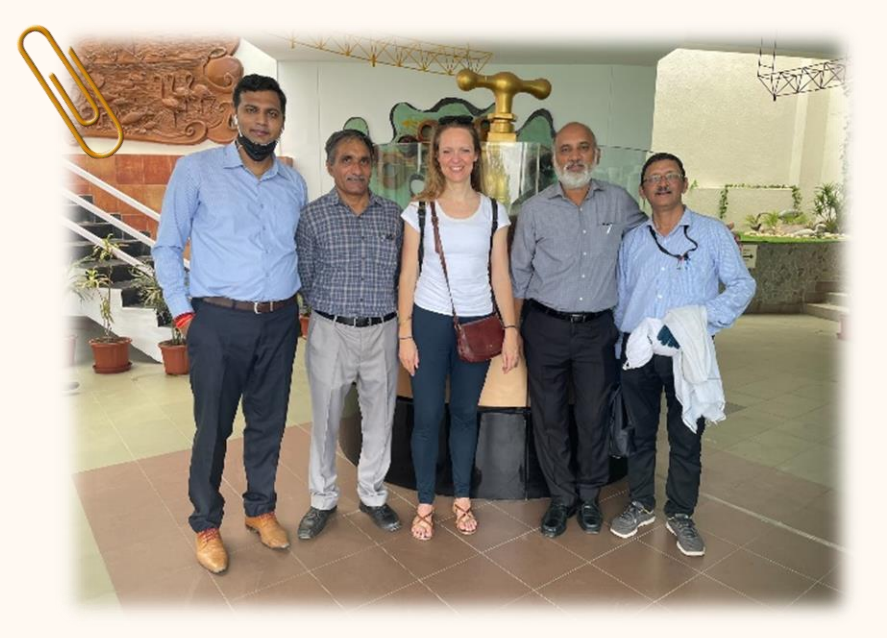
Visit to Wet Land facility developed and managed by EPCO at Upper Lake, Bhopal